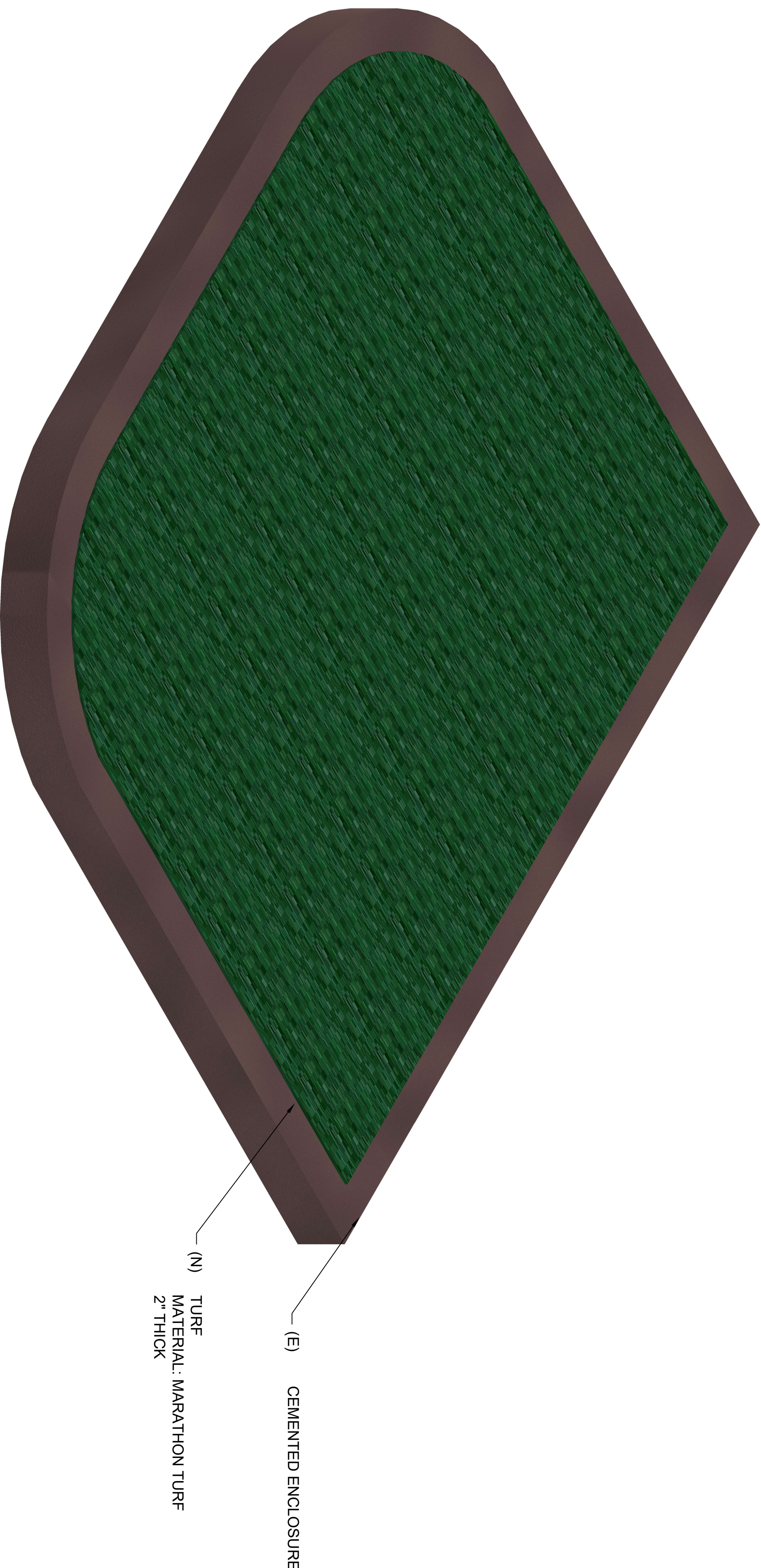
1 L01 3D RENDER SCALE: 1/2" = 1'